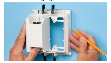
RETROFIT - Two-gang TVBU505 shown

Use enclosure (without trim plate) as a template for opening. Cut hole.