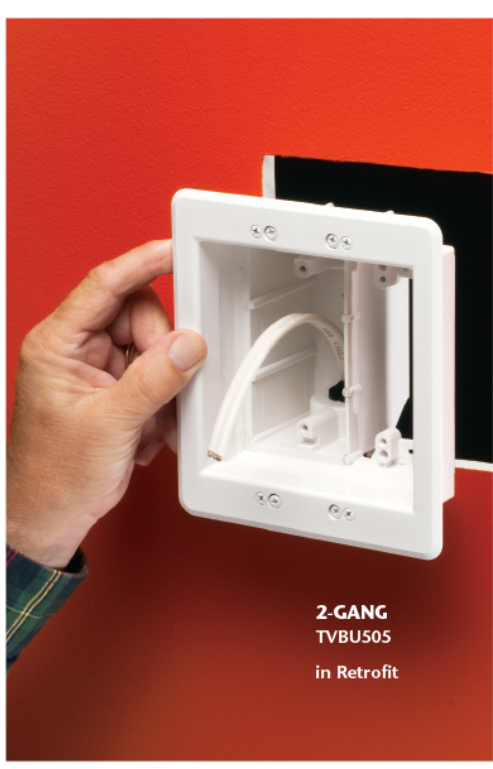
Two-Gang Power/Low Voltage Box for New Work or Retrofit