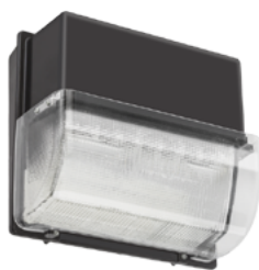
VG - Vandal guard