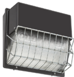
WG - Wire guard