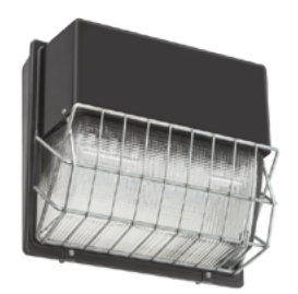
WG - Wire guard