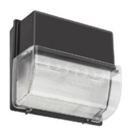
VG - Vandal guard