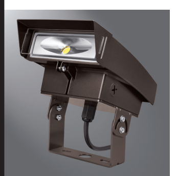
LUMINAIRE SOLD SEPERATELY