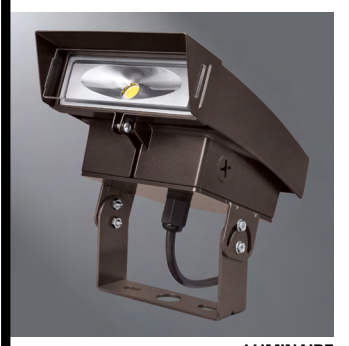
LUMINAIRE SOLD SEPERATELY