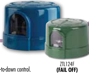
ZTL124F (FAIL OFF)